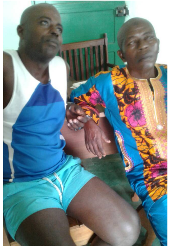
Arrested traffickers waiting for complaint reports wildlife office