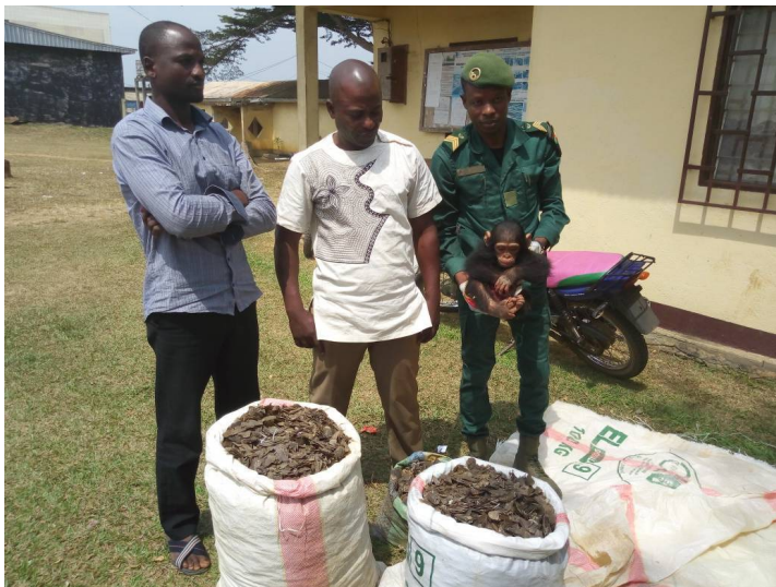
Wildlife officials who carried out arrest with pangolin scales (giant pangolin scales and black bellied pangolin scales) and traffickers being matched off after arrest (right)