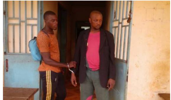
Two pangolin scale traffickers at the wildlife office shortly after they were found with 35kg of pangolin scales they were looking forward to selling, a third trafficker who escaped was later arrested (above)