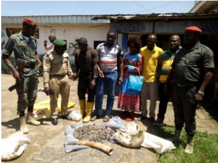
Four in front of Gendarmerie brigade following arrest for ivory and pangolin scale trafficking (above)