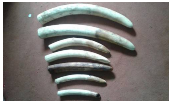
Trafficker at gendarmerie legion following his arrest with ivory and hippo teeth which he transported from the north hidden inside a cattle truck.