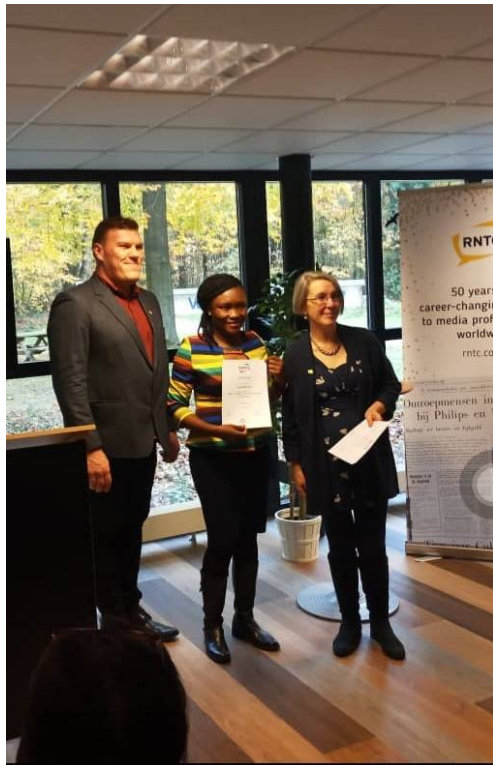
The media officer travelled to the Netherlands for a media training course and poses with some of her trainers at the media centre