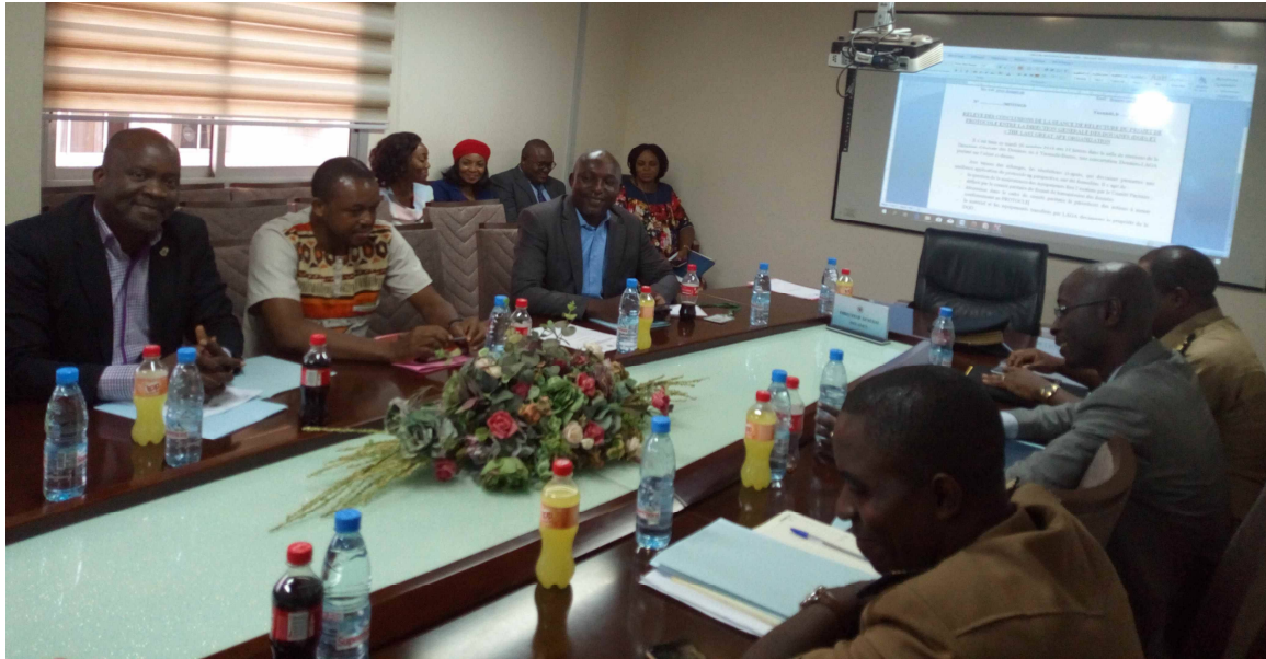
The Deputy Director in grey jacket and navy blue shirt accompanied by the heads of investigations and legal departments in talks with customs officials during MoU discussions