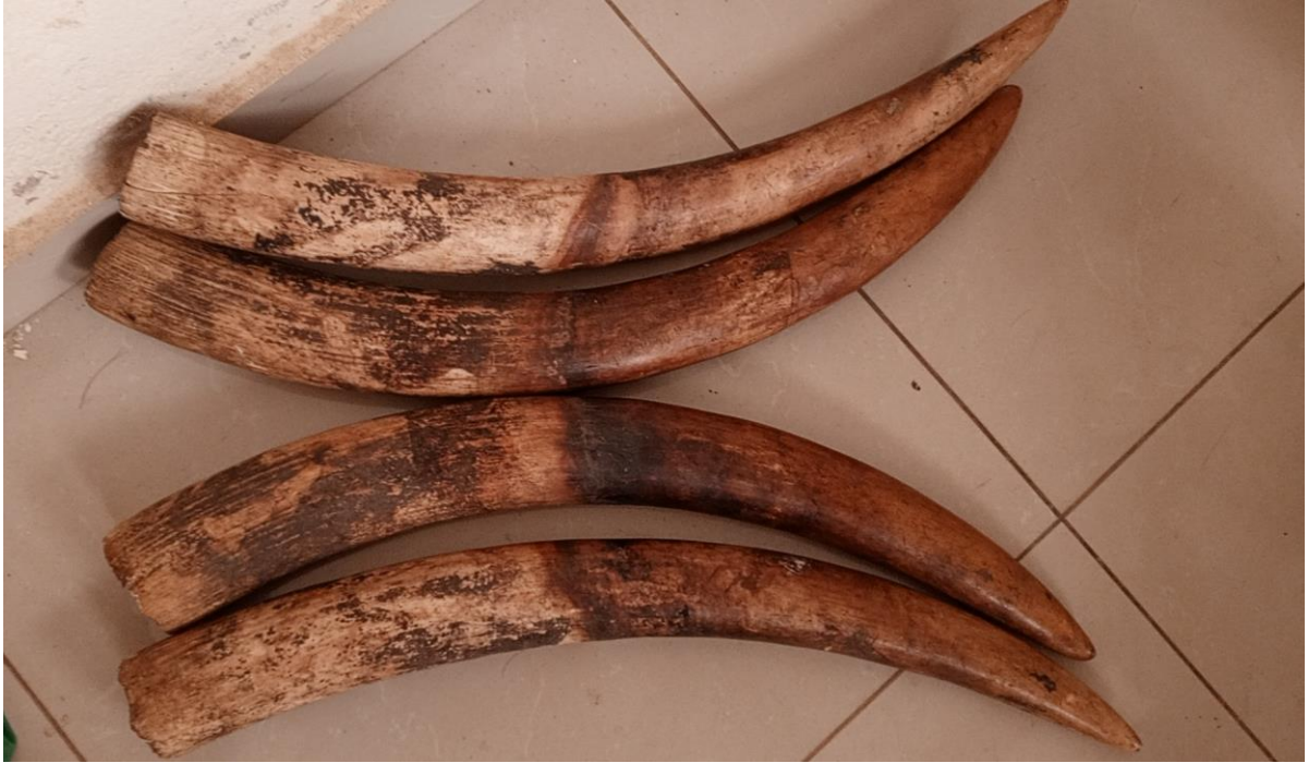
Four traffickers were arrested with four elephant tusks in Ebolowa, South Region.